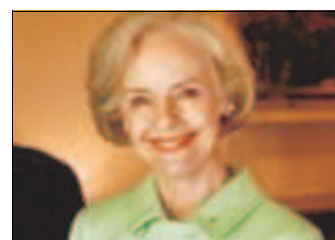
THE CBCA NATIONAL PATRON HER EXCELLENCY, MS QUENTIN BRYCE AC