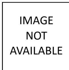
1/2: Coopa Crothers