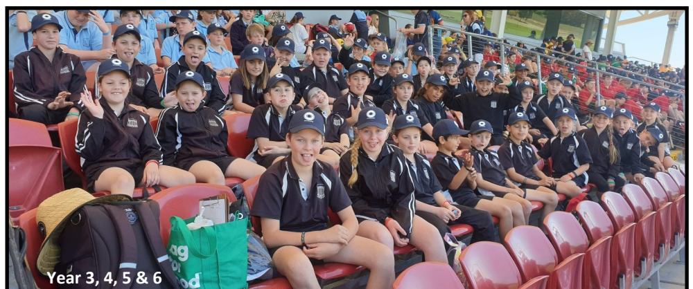
Year 3, 4, 5 & 6

Macquarie Sports Day Primary students had a ball!