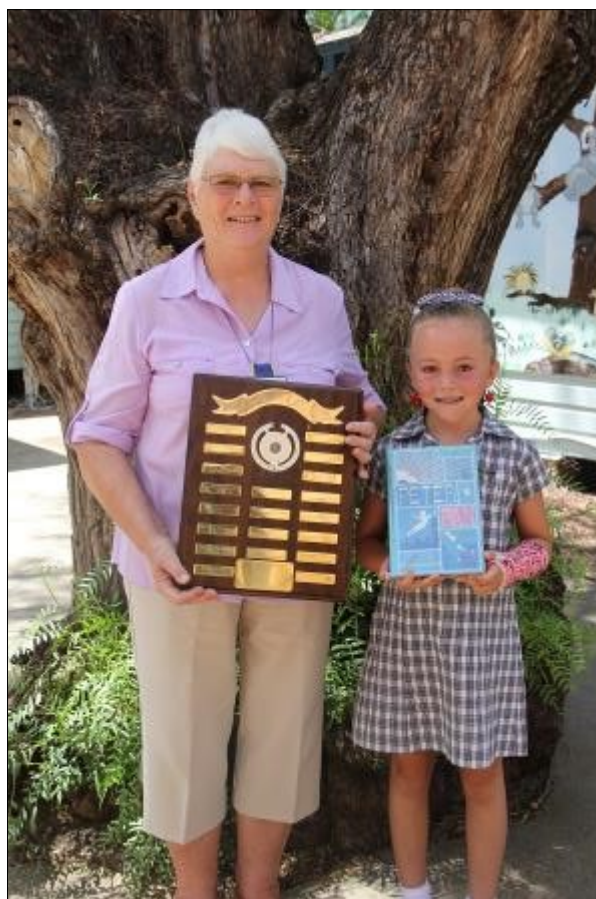
Barry Henderson Memorial Award