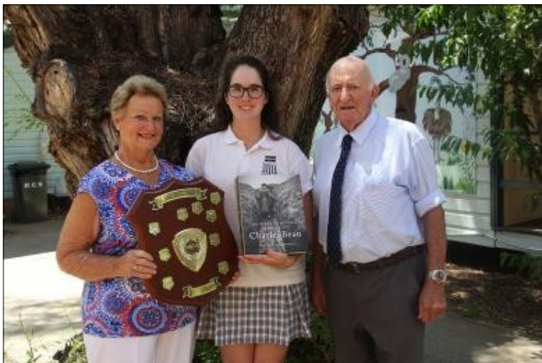
Gilgandra and Community Bank Community Award