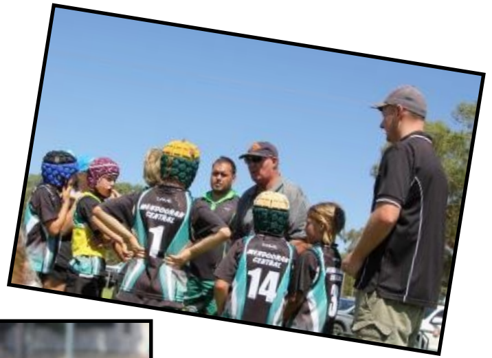
Russell Richardson Cup