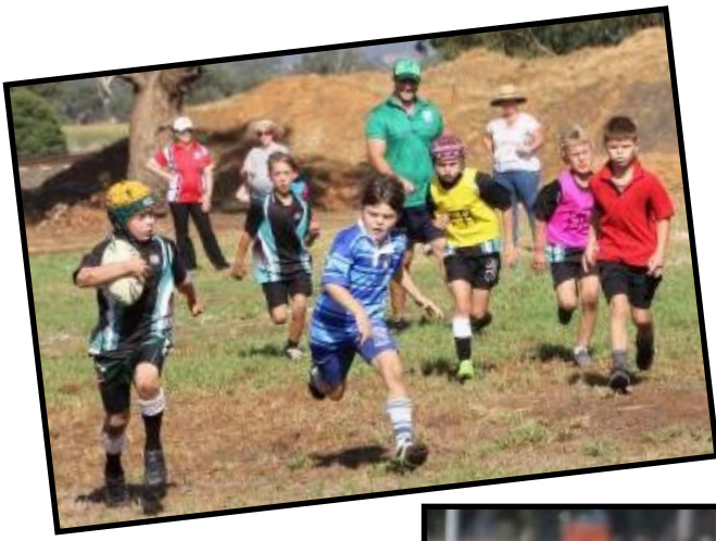
David Peachey Shield