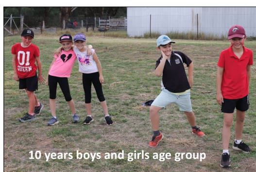
10 years boys and girls age group