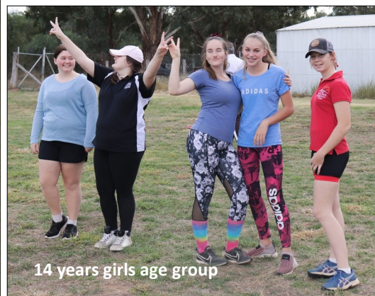
14 years girls age group