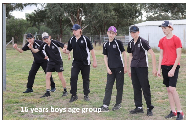
16 years boys age group