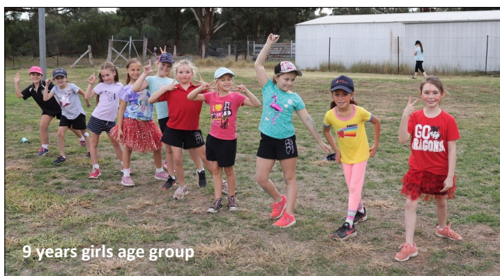
9 years girls age group