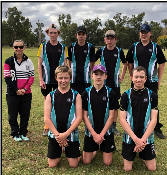
Mendooran Central School